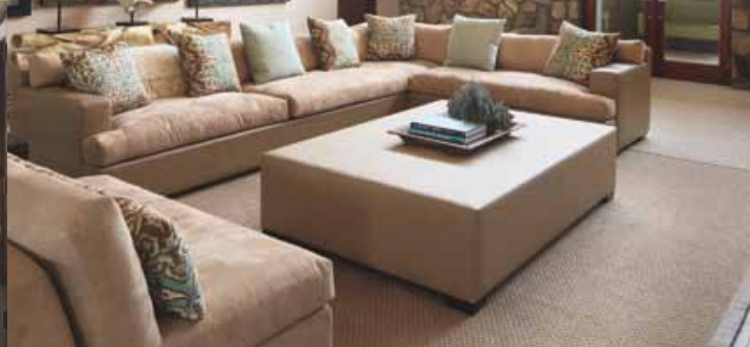
Views of Crow's Nest