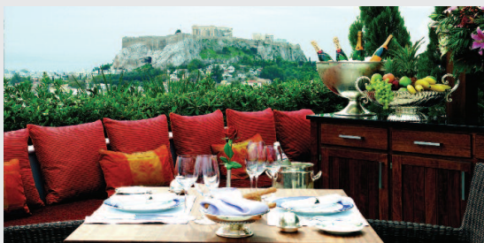
Hotel Grande Bretagne, Athens

From Greece, journey to Agios Nikolaos, in Crete's eastern corner, on to the land of miracles – Galilee and the hanging gardens at Bahai Gardens of Haifa; sail on to the UNESCO World Heritage town of Tel Aviv and savour the local cuisine, or wander amongst the artefacts in any of the numerous museums. Whilst in Turkey, you'll find the local handicrafts make great souvenirs.