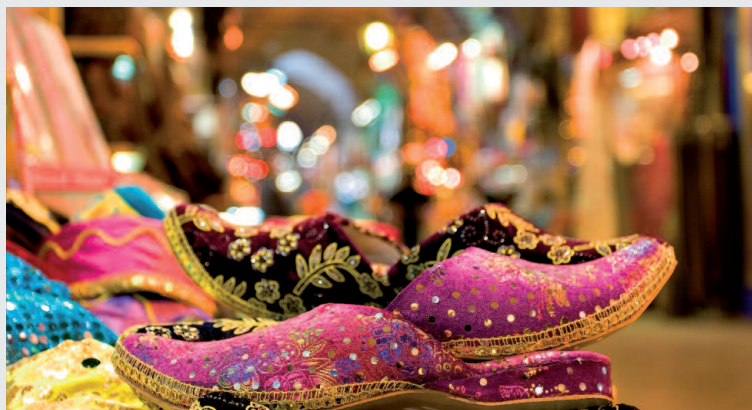
Market in Istanbul