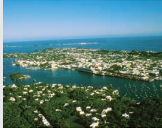
Hamilton Harbour, Bermuda