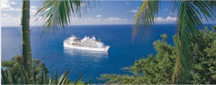
Seven Seas Navigator in the Tropics